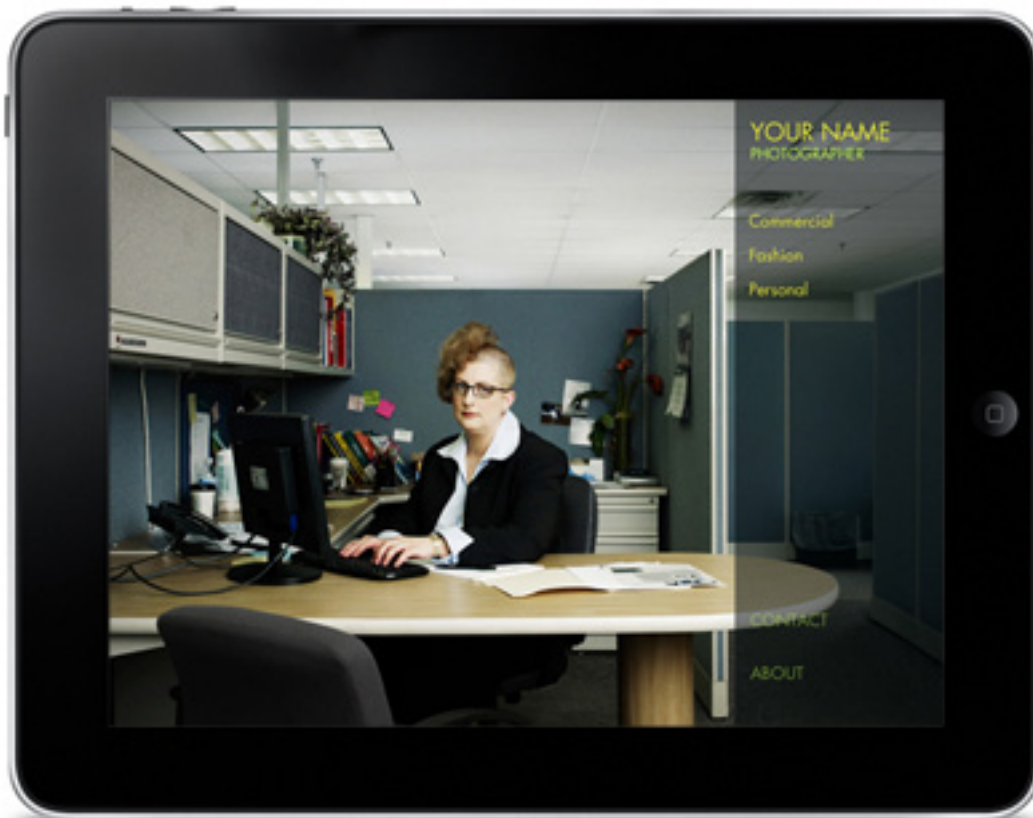
Branded Home Screen

“With the iPad your portfolio could be more than the printed portfolio.”